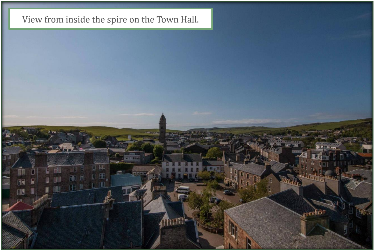
View from inside the spire on the Town Hall.

We aim to make a sustainable impact on the quality of life for everyone, making Kintyre a fantastic Place to live.